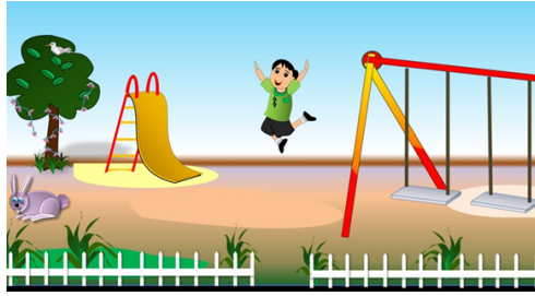
Boy :SSSVV Image Gallery: Search Keyword "jump"