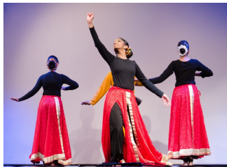
Students Dance Program

Notes to the teacher: The teacher could show the visual and verbal inputs to the students and encourage them to speak about the events and incidents they would like to share. The shy students can be encouraged to speak and share.