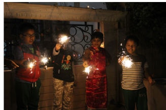
Diwali Mela (Fair)

Dancing