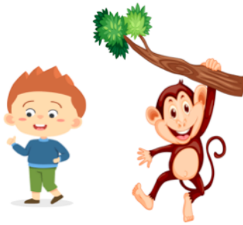
Boy: https://www.freepik.com/free-vector/set-happy-multiethnic-preschool-boys-standing-different-action_29006602.htm (Attribution: comp)