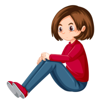
Happy: https://www.freepik.com/free-vector/boy-playing-with-remote-controlled-car_1311394.htm By iconicbestiary Sad: https://www.freepik.com/free-vector/one-teenage-girl-crying-white-background_8700531.htm By brgfs