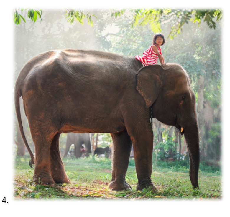
Elephant: https://pixabay.com/photos/child-africa-animal-asia-ties-1822494/ By sasint